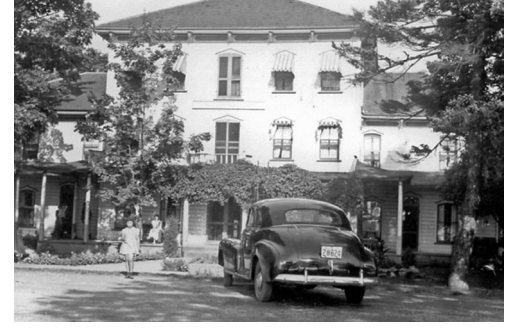
Lakeshore Lodge, about 1951